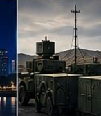
MILITARY & STRATEGIC USE